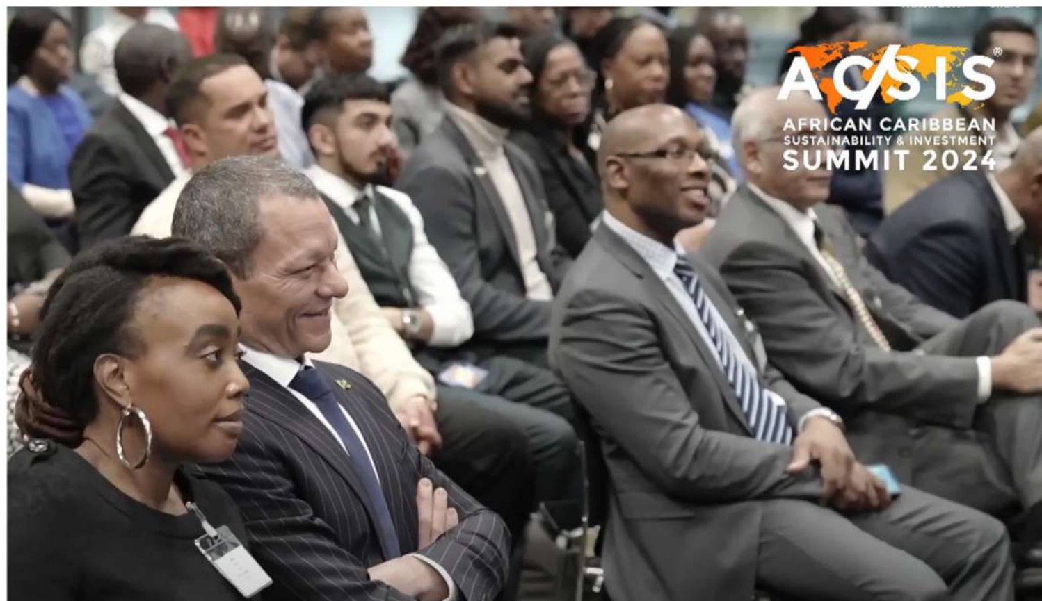
AC SIS 2024 delegates