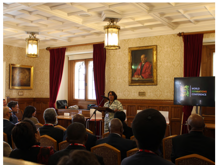
Image: Baroness Verma of Leicester opening the WRC 2025 Event at the UK House of Lords.

The session closed with a collective call to policymakers, business, and diaspora communities to collaborate on education, equity, and empowerment—ensuring reparative justice translates into tangible economic and social outcomes.